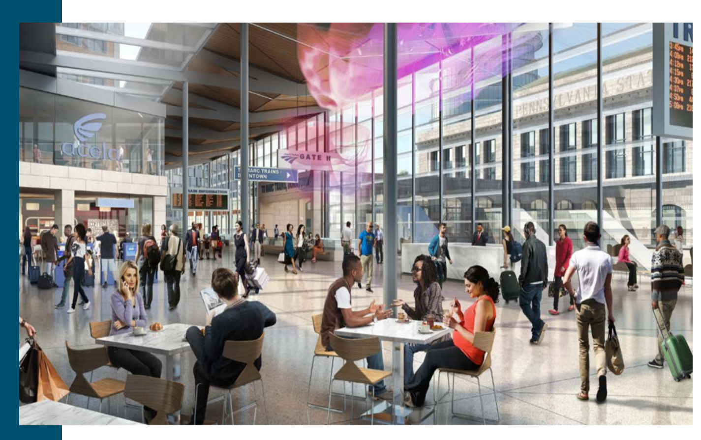
Concept plan of new Amtrak station operations relocated across the tracks to the Lanvale site and looking out to the historic head house.